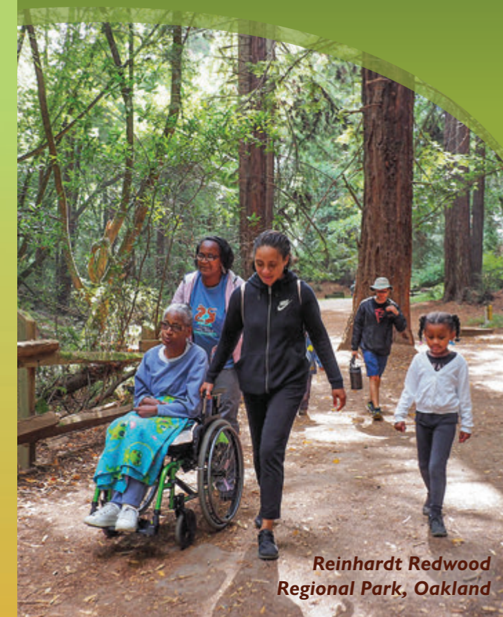
Reinhardt Redwood Regional Park, Oakland