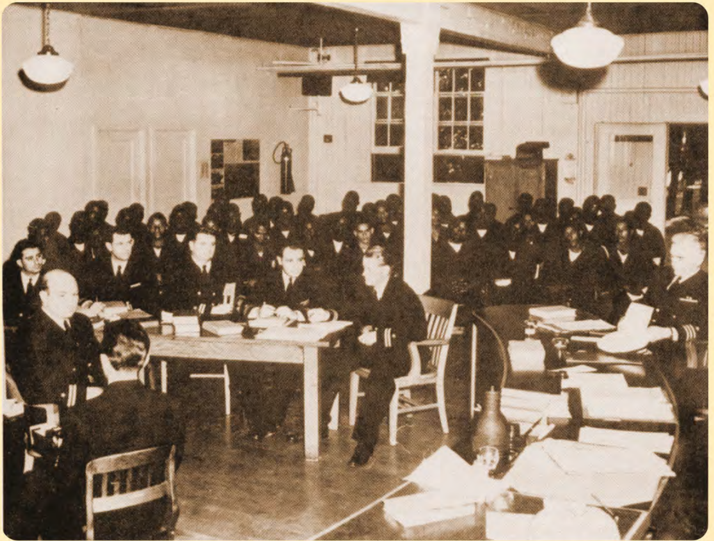
1944 mutiny trial of the Port Chicago 50