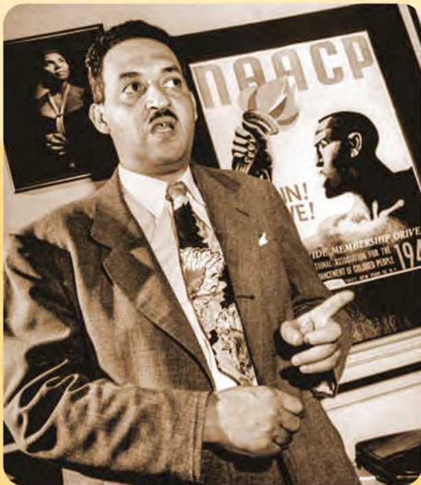
NAACP Chief Counsel Thurgood Marshall

“I do not take up cases unless I am convinced the men are innocent. I was never so convinced that the evidence was insufficient in a case as I was listening to that case... There is no sufficient evidence of mutiny or conspiracy. These men are being tried for mutiny solely because of their race.”