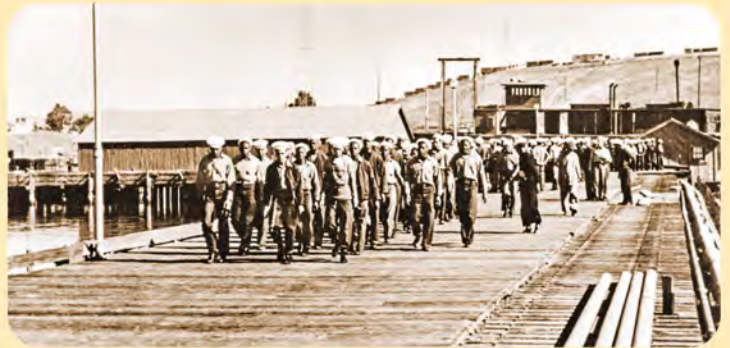
Port Chicago sailors

When ordered to return to loading ammunitions, over two hundred sailors refused to return to work due to the unsafe working conditions which resulted in the explosion. These sailors courageously advocated for safety for themselves and others in requesting adequate training and equipment before returning to work. In response, the Navy identified fifty Black sailors as the leadership of the organized action. The Navy charged these individuals with mutiny. This decision resulted in one of the most significant mutiny trials in U.S. military history. The fifty sailors were supported by then NAACP Chief Counsel Thurgood Marshall who through the press raised the racist nature of the